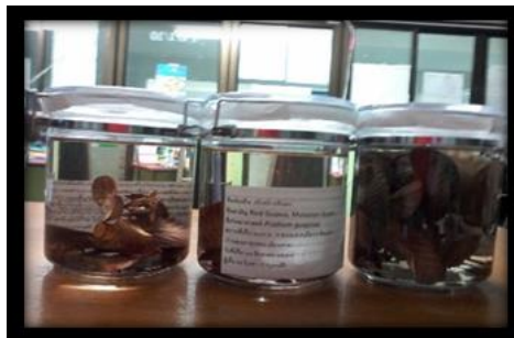
Figure 4: Herbarium and pickled green preservation of Pharangkrang

These knowledge on morphology of Pharangkrang, the marketing and the community enterprise have been transferred to SC and BC through lecturing. The method of reproduction has been done through training by workshop CIPP model project. The results show that, branches castration have grown in BC and SC on land of the owner of Pharangkrang tree. It shows that the samples' skill is not sufficient. Next the samples reproduce the Pharangkrung tree for 10 branches castration. (Figure5).