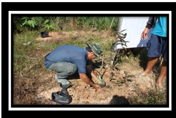
Figure 5: Branches castration of Pharangkrang have grown in BC and SC

This project has evaluated. The sample included 34 persons in SC and BC. There were 26 males (76.47%). The oldest men were 40-60 years old (8.82 %). Most of them were (24) farmers (70.58 %). The results indicate that overall of this project is in the high level. ( X=3.88 , S.D=0.62 ) and overall of every aspect is, too. This is the series of means from the highest to the lowest. First, the cortex of this project ( X=4.00 , S.D=0.65 ), second input ( X=3.99 , S.D=0.73 ), process ( X=3.80 , S.D=0.80 ) and the lowest mean is the product aspect ( X=3.74 , S.D=0.92 ). It shows that there are good plan, good preparation, and good practice. These are effects to the product. (Table1) Related to Boonprasert, Uthai (2005) reports, that if there are good and efficient plans and best practice is followed, then good results are expected.