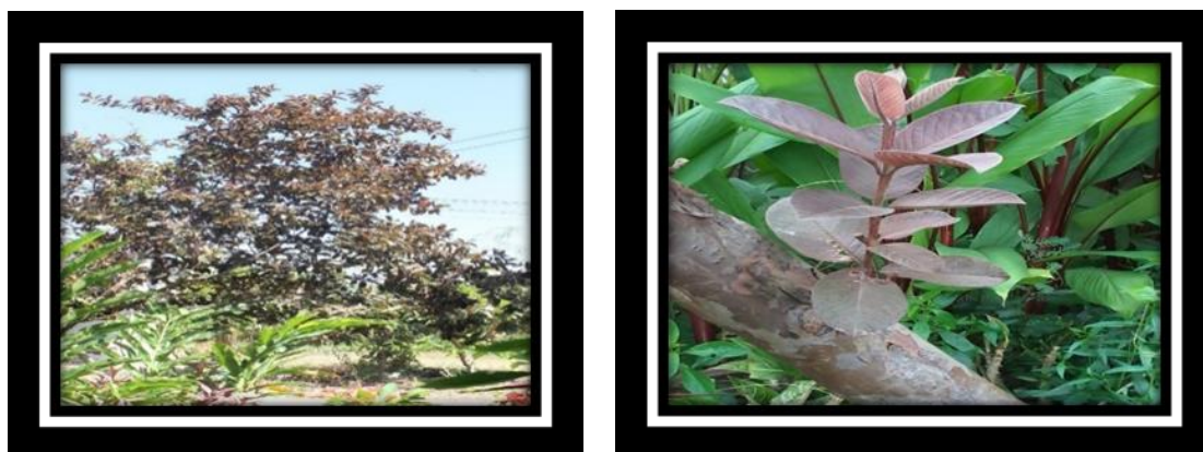
Figure 2: Pharangkrang and the stem

It is simple leaf, no stipule, rough, and rather dark red color. It is in oval shape, entire margin, obtuse apex and truncate base. The 2 leaves are opposite, and the pairs of leaves are decussate. The netted vein is red color. There are 4 levels in structural leaf. Flower is solitary, perfect, regular and complete flower on the receptacle. The upper of 5 sepals are pink and the lower are greenish red color. 5 petals are pink and aren't connected to each other. The multiple stamens are not connected to each other and bend to inside while it is delicate flower. The filaments are long and pink color. The pistil is pink color and the ovary is in inferior receptacle. The fruit is simple, round and small. The delicate and ripe fruits are dark red color, smell and typical berry type. The external pericarp of this fruit is dark red color but the mesocarp connected with endocarp are pink. About 70-80 strength seeds are small, round, light brown and no food collection. The color from bark is used for dyeing. It is decorative plant in Thailand because it looks beautiful ( http://www.specialtyproduce.com/produce/Red_Malaysian_Guavas_9 -11-2016 (Figure 3)