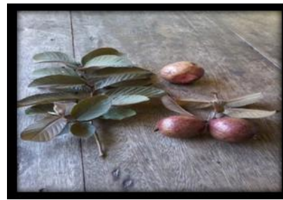
d) leaves and fruits