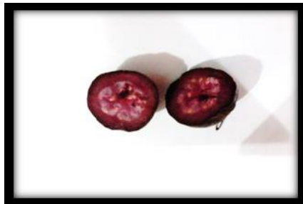
e) half of fruit