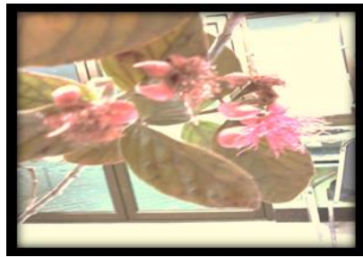
c) pink flowers