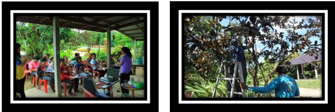
Figure 1: Transfer the knowledge to the people in SC and BC through lecturing and training