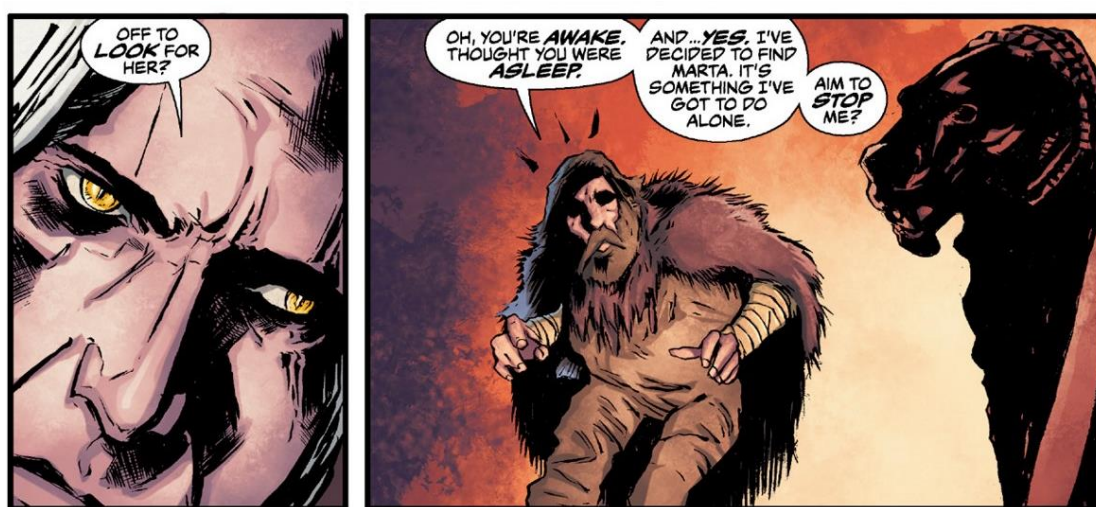
Image 1. Comic books use visual cues to convey emotions (Tobin, Querio, 2014, p. 15)

Emotionally loaded pauses and breathing breaks can also be indicated in comics to bring the reading experience even closer to that of encountering real-life speech (Williams, 1995). Likewise, the author(s) can leave clues as to how a line is supposed to sound when spoken by the use of specific letter fonts: the same line appearing to be coated with ice, or sticky and bloody may sound stern or angry (Eisner, 1985; McCloud, 1993).