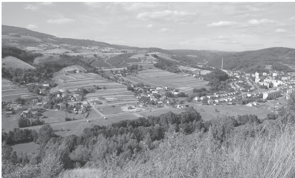
Figure 3. The Hriňová study area 3. ábra A Hriňová vizsgálati terület

The Liptovská Teplička study area comprises mountainous arable grassland landscape with traditional agriculture (Figure 4.).