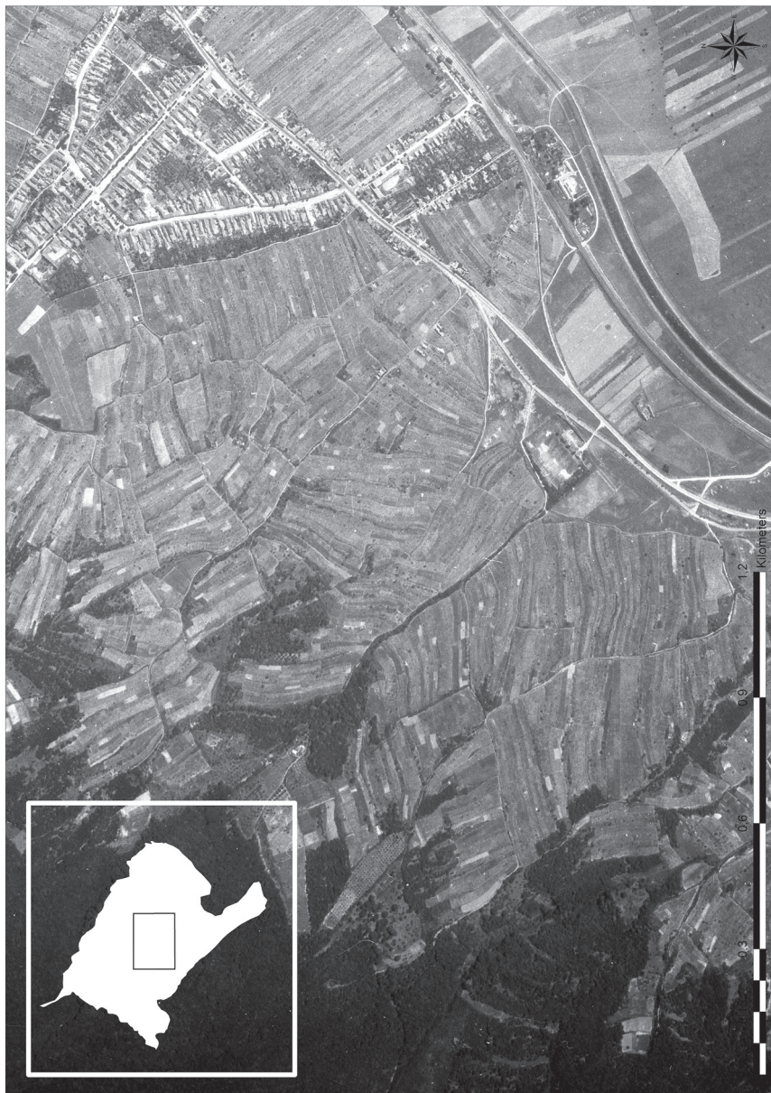
Figure 6. The Svätý Jur study area in 1945 – typical landscape pattern formed by traditional vine growing for many centuries 6. ábra A Svätý Jur terület 1945-ben – tipikus tájmintázat, amelyet a több évszázados szőlőtermesztés alakított ki