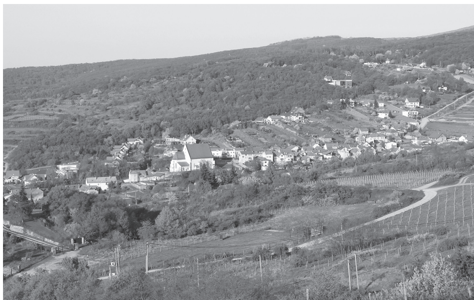
Figure 2. The Svätý Jur study area 2. ábra A Svätý Jur vizsgálati terület

The Svätý Jur study area has a viticulture-arable landscape with forest and preserved fragments of traditional vineyards. It is situated at the interface of the foothill relief of the Little Carpathians Mts. and the Danube plane, with the central compact settlement being the historical town of Svätý Jur (Figure 2.). It is located in western Slovakia, 15 km from the Bratislava capital. The study area lies at an altitude varying from 126 to 514 m and it covers 3,987 ha, with 1,015 ha agricultural land. The area was settled in the 9 th century with wine growing in this territory dating from the Roman settlement era. Here, the advanced technology in wine growing and wine trading were strongly influenced by German colonists settling Svätý Jur before 1200 AD. Terraces on steep slopes were created over several centuries; prevalingly on crystalline subsoil with cambisols and rankers. These illustrate traditional wine growing practices. Following establishment of an agricultural cooperative in 1950, most of the traditional vineyard land was completely changed between 1970 and 1980 to new, larger vineyard terraces. Thus, the greatest portion of the traditional small-structured vineyard landscape was destroyed.