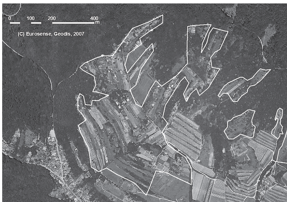
Figure 11. Traditional vineyard agricultural landscape with dominant vineyards and other land use forms with buildings

11. ábra Hagymányos agrártáj szőlő dominanciával és egyéb tájhasználati formák épületekkel