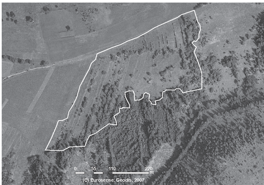
Figure 12. Traditional agricultural landscapes of arable land and grasslands with grasslands only (code 404), other types of land use are not present

12. ábra Hagyományos agrártájak szántóval és füves területek kizárólag gyepekkel (404-es kód), más tájhasználat nincs jelen