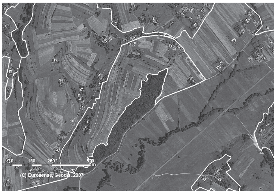
Figure 10. Traditional agricultural landscape with dispersed settlements, a mosaic of grasslands and arable land; where no present land use types dominate

10. ábra Hagymányos agrártájak szétszórt településekkel, füves mozaikkokkal és szántókkal, ahol egyik jelenlegi tájhasználat sem dominál