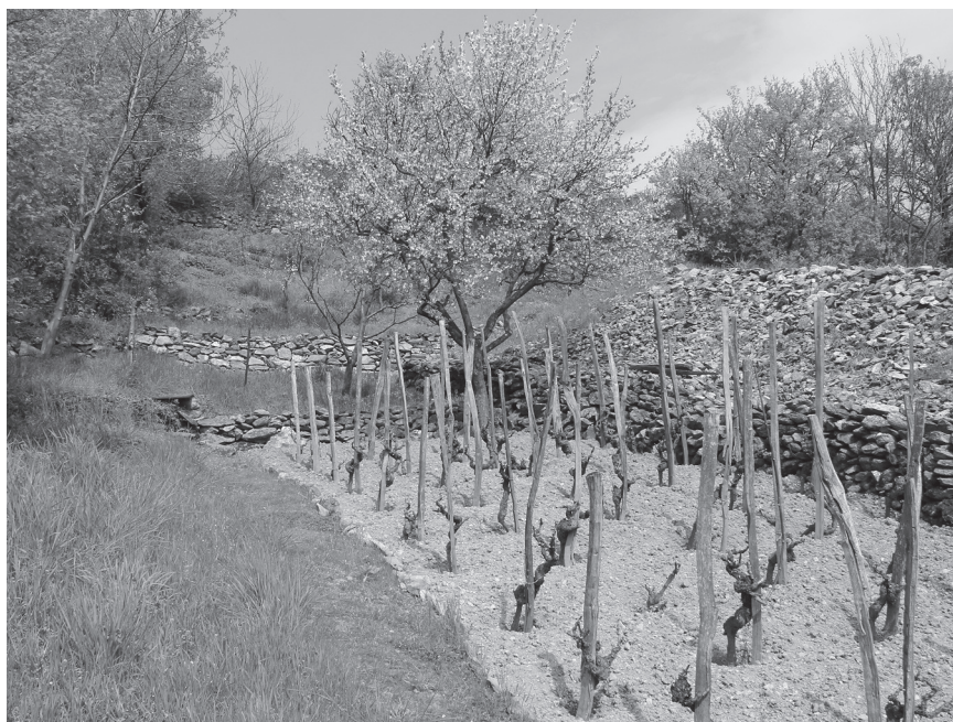
Figure 9. Unconsolidated walls were built from stones to form supporting walls for vineyard terraces and these are characteristic in Svätý Jur

9. ábra A szőlő-teraszok megerősítésére szolgáló, kötőanyag nélküli kőfalak a Svätý Jur mintaterület jellegzetességei