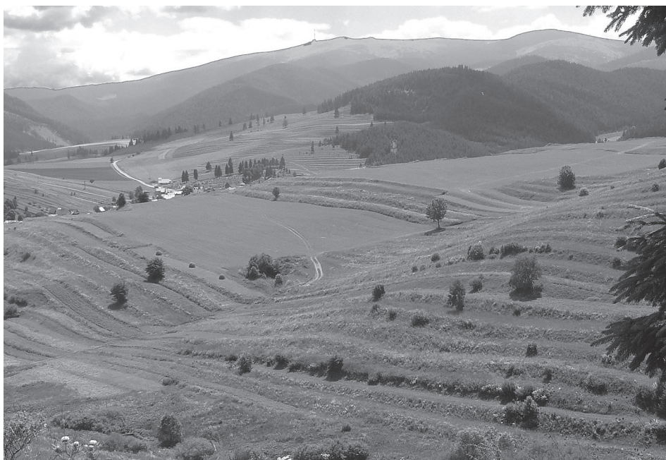
Figure 4. The Liptovská Teplička study area 4. ábra A Liptovská Teplička vizsgálati terület

The Liptovská Teplička study area comprises mountainous arable grassland landscape with traditional agriculture (Figure 4.).