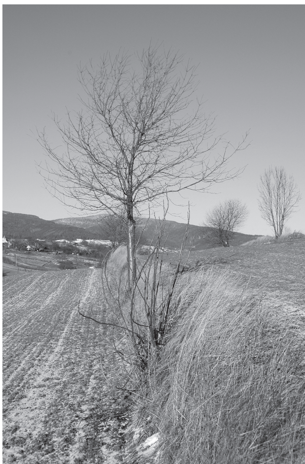
Figure 8. Step balks situated on moderate slopes are characteristic features of Hriňová study area

Most TAL sites are located on steep slopes (over 12%), on shallow and skeletal soils. This reflects the presence of different forms of anthropogenic relief, formed over many centuries which remain preserved today. The terrace slopes were created during long-term land cultivation of arable fields on steep slopes and these mainly occur in Liptovská Teplička study area. They create natural habitats covered by grass or bushes. Step balks situated on moderate slopes are characteristic features of Hriňová study area (Figure 8.). Solitary heaps and lengthwise mounds were formed by cultivation of arable land and removal of the skeleton on the borders or in the centre of the plots. These occur in all three cadastres. Unconsolidated walls were built from stones to form supporting walls for vineyard terraces and these are characteristic in Svätý Jur (Figure 9). Slope mounds and heaps formed on terraces were rarely found in Liptovská Teplička and Hriňová study areas.