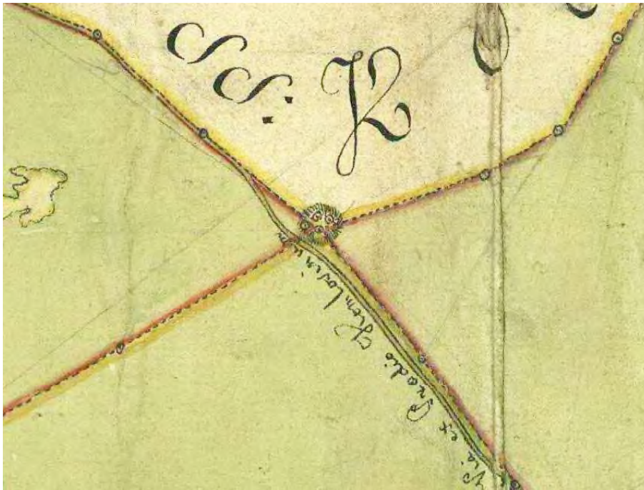
Figure 1. The Barta-halom kurgan (between Mezöhegyes, Tótkomlós, Nagyér and Ambrózfalva settlements) with four boundary sign on a handmade map from the 18 th century (MOL S. 11. 80)

1. ábra A Barta-halom négy település (Mezöhegyes, Tótkomlós, Nagyér és Ambrózfalva) határán, rajta négy határdombbal egy 18. századi kéziratos térképen (MOL S. 11. 80)