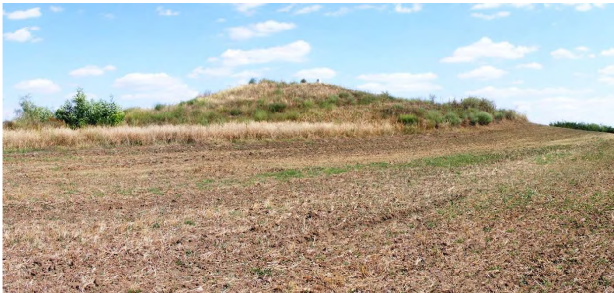
Figure 3. The Tatár-halom (between Lőkősháza and Sânmartin/Szentmárton) is the highest kurgan of the study area

3. ábra A Tatár-halom (Lőkősháza és Szentmárton/Sânmartin határán) a vizsgálati terület legmagasabb kurgánja