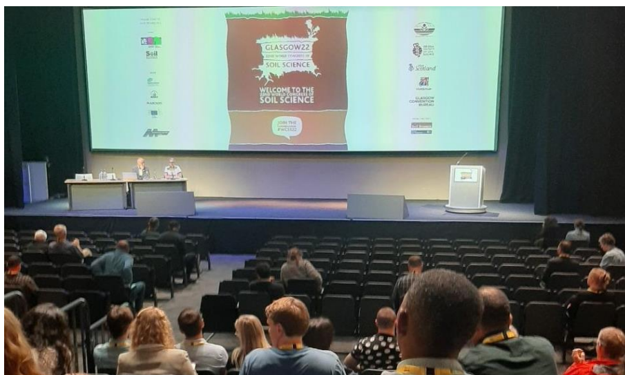
Figure 1. Oral section (spatial decision making and mapping for implementing polices for sustainable soil management) with the participants

The theme of the Congress focused on the relationship between soil and society, soils and land use in the twenty-first century, data and information. Different sessions covered verities of subjects e.g. soil systems, soil processes, soil management and how we interact with and use soils around the world (Figure 1.). In addition, specialist workshops and discussion sessions took place across a wide range of soil disciplines.