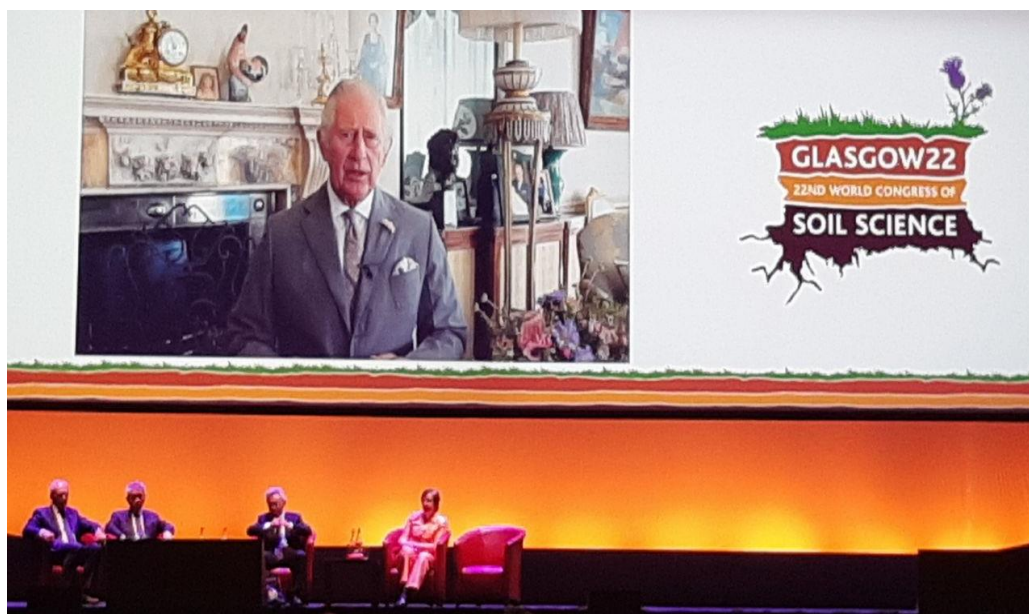
Figure 3. Closing ceremony with Prince Charles's speech

2. ábra Szilágyi Alfréd (jobbról a második) a Magyar Agrár- és Élettudományi Egyetem Környezettudományi Doktori Iskolájának doktorandusz hallgatója a poszterénél