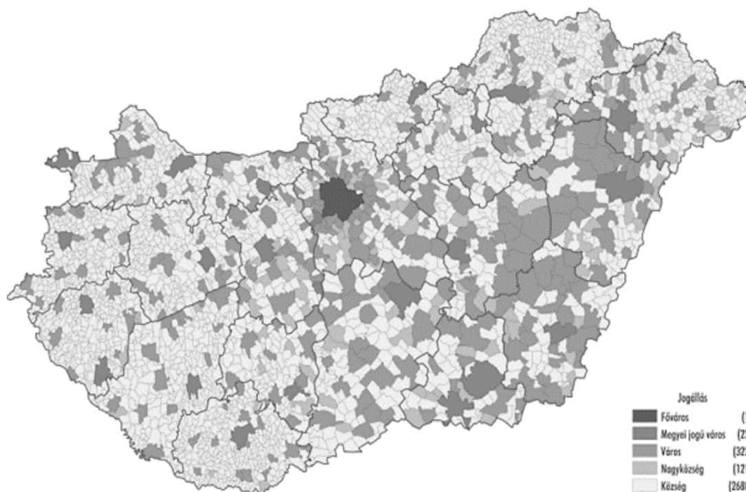
Figure 1: City- and population density in Hungary

The proportion of urban population is over 50% globally. The dominant role of cities is further emphasised by the facts, that 80% of GDP is produced there and 70% of energy is consumed by cities. According to preliminary estimates, the number of city inhabitants is expected to rise to 5 billion by 2030. However, considering the territorial differences that characterize the world, there are significant disparities between continents, countries and regions in the case of urban populations as well. While approximately 66.4% of the population in the United States is currently living in cities, in Europe this proportion is approximately 73%. Figure 1 shows the most up-to-date situation (May 3, 2019) about the population- and city density of Hungary.