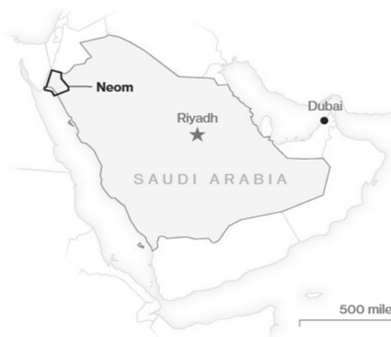
Figure 2: The future geographical position of Neom

Taken from the project website: "NEOM is positioned to become an aspirational society that heralds the future of human civilization by offering its inhabitants an idyllic lifestyle set against a backdrop of a community founded on modern architecture, lush green spaces, quality of life, safety and technology in service of humanity paired with excellent economic opportunities." (Discoverneom.com, 2017)