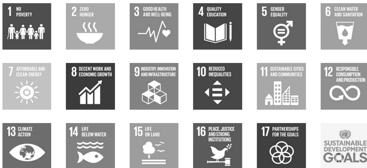
Figure 4: The Sustainable Development Goals of the United Nations

These elements do not necessarily require advanced technology, or even high budget. For instance, good health conditions do not necessarily mean expensive hospital equipment. In 2016, the Hungarian Government published the Strategy for a Healthy Hungary 2014-2020 (Egészséges Magyarország 2014-2020), in which prevention received a well-earned place, since Hungary usually lags behind other OECD countries in regard to preventing sicknesses. More focus on prevention, however, brings long-term effects on well-being and prevention activities can be carried out with relatively low costs, and on local levels as well (meaning that they can be universal development tools).