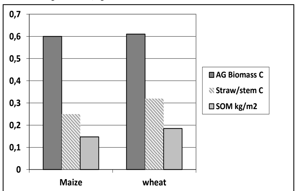
Figure 2. Carbon content of above ground biomass, straw/stem residues, and the possibly derived soil organic matter, kg/m<sup>2</sup>

Figure 1. presents a graphical evidence of carbon sequestration performance differences of the two crops examined.