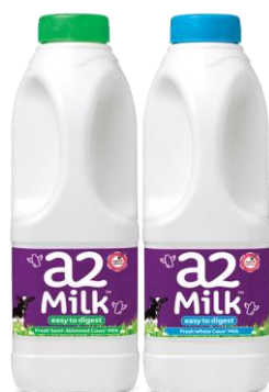
Figure 2: A2 milk products on the market (Internet1)

In August 2003, ‘The a2 Milk Company’ exclusively licensed patent and trademark rights to US-based Ideasphere Incorporated (ISI) to market a2 Milk products in North America (A2 Corporation, 2004).