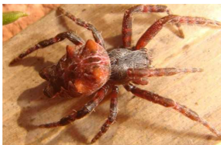
Figure 2. Cyrtophora citricola (Forsskál, 1775)

Cyrtophora citricola (Forsskál, 1775) (Figure 2) – We collected this species in more than one place in Morocco, including the parts of Kenitra (1♀, 34°15'02,60"N, 6°35'00,00"W, 10.08.2012., J. Gál) and Mohammedia (3♀, 2♂, 33°40'59,96"N, 7°23'00,00"W, 10.09.2012., J. Gál). We found more than one web between the branches of a medieval thuja located in Rabat (4♀, 33°59'05,71"N, 6°51'148,04"W, 02.08.2013., J. Gál).