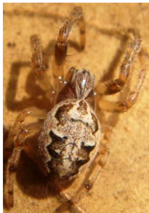
Figure 3. Larinioides cornutus (Clerck, 1757)

Larinioides cornutus (Clerck, 1757) (Figure 3) - We collected the spider close to Sidi Boukhalkhal and its web on dried vegetation close to a lake (1♀, 1♂, 34°06'03,16"N, 6°19'21,96"W, 13.10.2012., J. Gál).