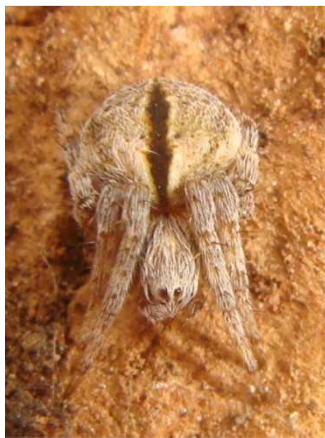
Figure 1. Agalenatea redii (Scopoli, 1763)

Agalenatea redii (Scopoli, 1763) ( Figure 1. ) - The species was found in a strip of cork oak next to Sidi Allal el Bahraoui, (1♀, 34°06'01,48"N, 6°19'21,69"W, 20.09.2013., J. Gál).