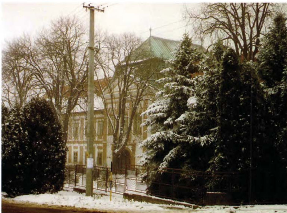
Fig. 6. Palárikovo (Tótmegyer)