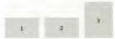
Fig. 1. The neglected manor of Hul (Hull) Fig. 2. Jatov (Jattó) Fig. 3. Komjatice (Komjät)