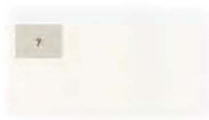
Fig. 7. Šarkan (Šarkányfalva)