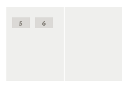
5. kép/pict.: The 2004 LE:NOTRE Conference and workshop at the Buda Campus

The project's goal of cementing and strengthening the landscape architecture academic community was further pursued through the development of the project web site. At the start of the project in 2002 the web site was seen as being a vital part of the process of building the academic community. It was also viewed as the key to extending the activities of ECLAS beyond the annual conference and throughout the whole year. From the beginning, the web site was also conceived as a communication platform and as a focus for the project consortium to collect information and thus to create meaningful content. This, it must be remembered,