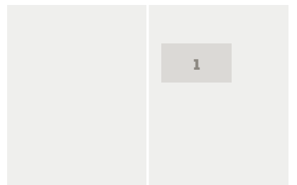
The establishment of new landscape architecture programmes in Europe (from Birli, 2016)2

involved over 150 schools, provided both the necessary resources and the momentum to advance the goals of ECLAS, now the European Council of Landscape Architecture Schools, and to take the establishment of a stable European academic infrastructure for landscape architecture to a new level. This paper will reflect on these developments in their wider context.