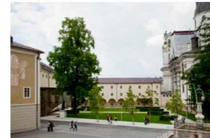
Fig. 12: The site plan shows the quartzite frame and hedges inspired by Baroque garden theatres as still existing in Mirabellgarten, Salzburg