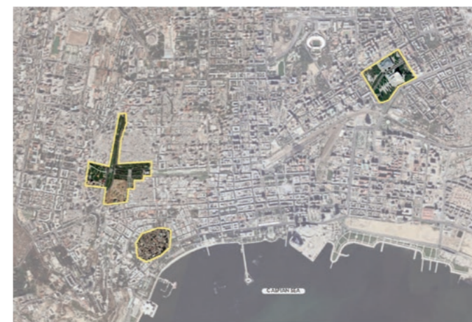
Fig. 21: Project map of BAKU Central Park including the Mosque Garden, the Sports Park with playgrounds and areas for sport and the Wood Park in the West